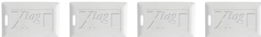
Long range Active tags

“The most advanced ultra long range RFID electronic tagging products”!